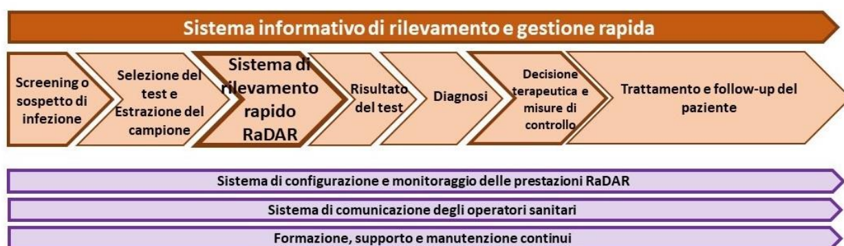
Figure 2. Workflow after implementation of the RaDAR integral solution

The RaDAR integrated IT management service will support healthcare professionals during the pathway from screening and/or suspicion of infection to patient follow-up (Figure 2).