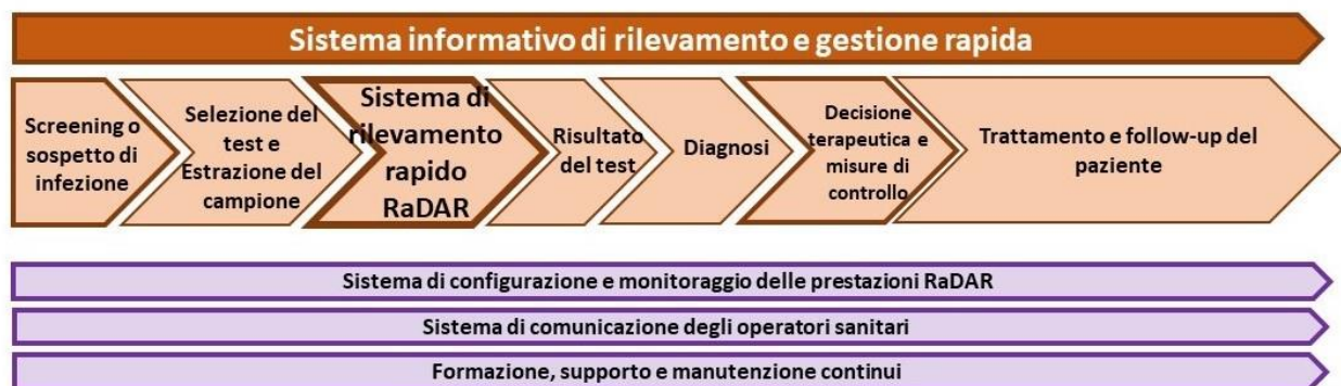
Figure 2. Workflow after implementation of the RaDAR integral solution

The RaDAR integrated IT management service will support healthcare professionals during the pathway from screening and/or suspicion of infection to patient follow-up (Figure 2).